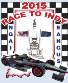
EXHIBIT APPLICATION & CONTRACT

ENLISTED ASSOCIATION OF THE NATIONAL GUARD OF THE U.S. (EANGUS)