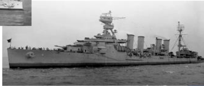
Omaha-class Cruiser, Commissioned in 1923 Transferred to the Soviet Navy as Murmansk in 1944, Returned /Scrapped in 1949