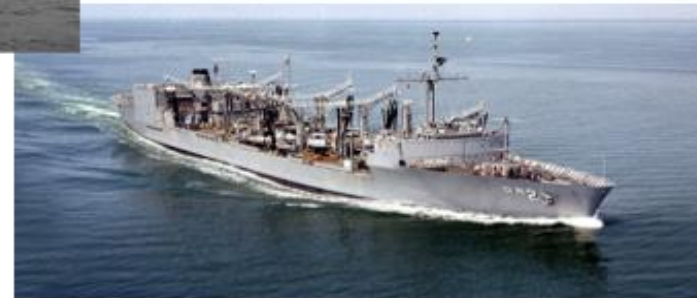
Wichita-class replenishment Oiler Commissioned in 1969 Decommissioned in 1994

“USS Milwaukee (LCS 5), A Navy ship to be commissioned in her namesake city, in the state she was built, among the hands that built her”