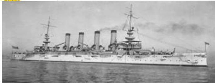
St. Louis-class Cruiser, Commissioned in 1906 Decommissioned in 1917