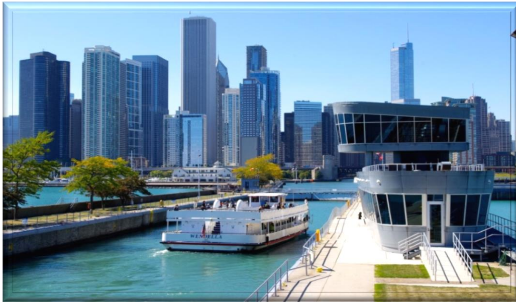
Chicago Harbor Lock

The Chicago District is responsible for water resources development in the Chicago and Northwest Indiana metropolitan area, a unique urban area of about 5,000 square miles with a population of approximately 9.1 million people.